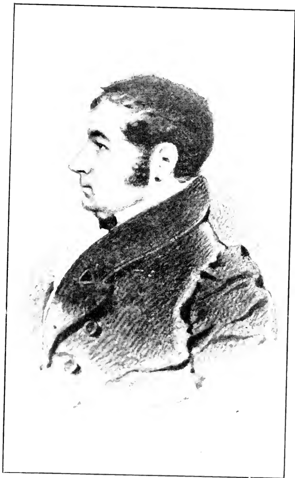
JOHN PAULDING Born 1758 — Died 1818